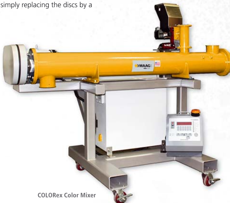
COLORex Color Mixer

By using our color mixers, the cleaning times of a central mixer can be eliminated. Pellets are dyed directly from the pulverizer or from a silo.