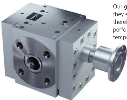
extrex 6 GU

Our gear pumps optimize the extrusion process of thermoplastics and elastomers since they ensure a constant flow of material, generate the required operating pressure and therefore relieve the extruder of pressure build-up. This increases the production plant's performance, improves the quality of the end product, performing at lower melt temperatures extends the extruder's lifetime. The innovative design allows highest speeds and highest throughput rates for a given pump size.