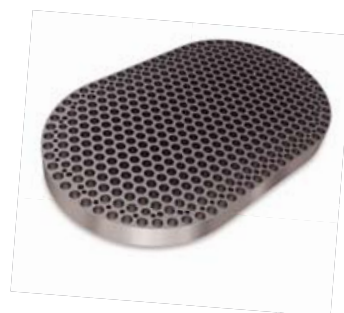
Different cavity options for screen changers (round, oval, arched, candles)